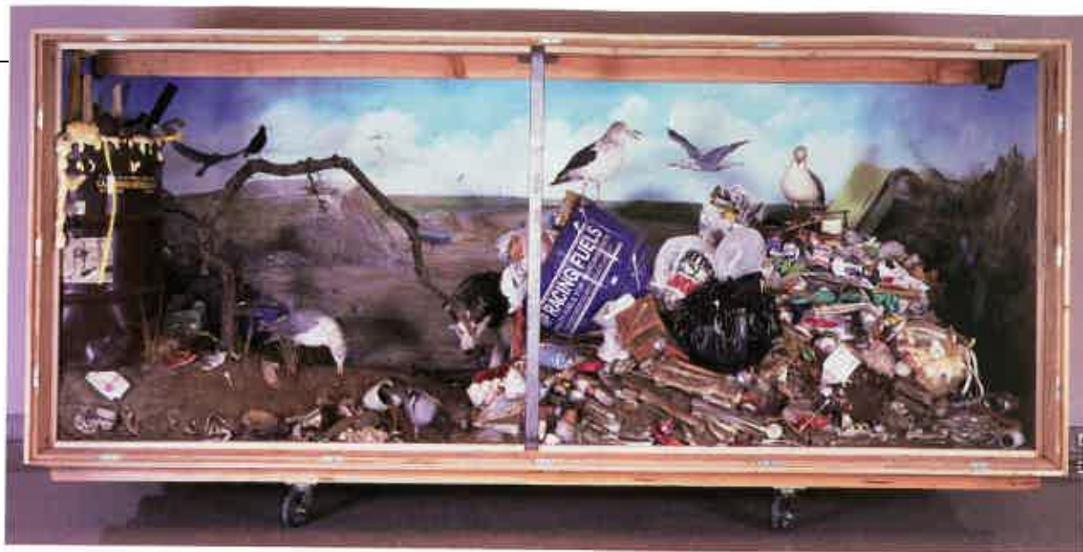
Mark Dion: Landfill , 1999–2000, mixed mediums, 71½ by 147½ by 64 inches. Museum of Contemporary Art San Diego.